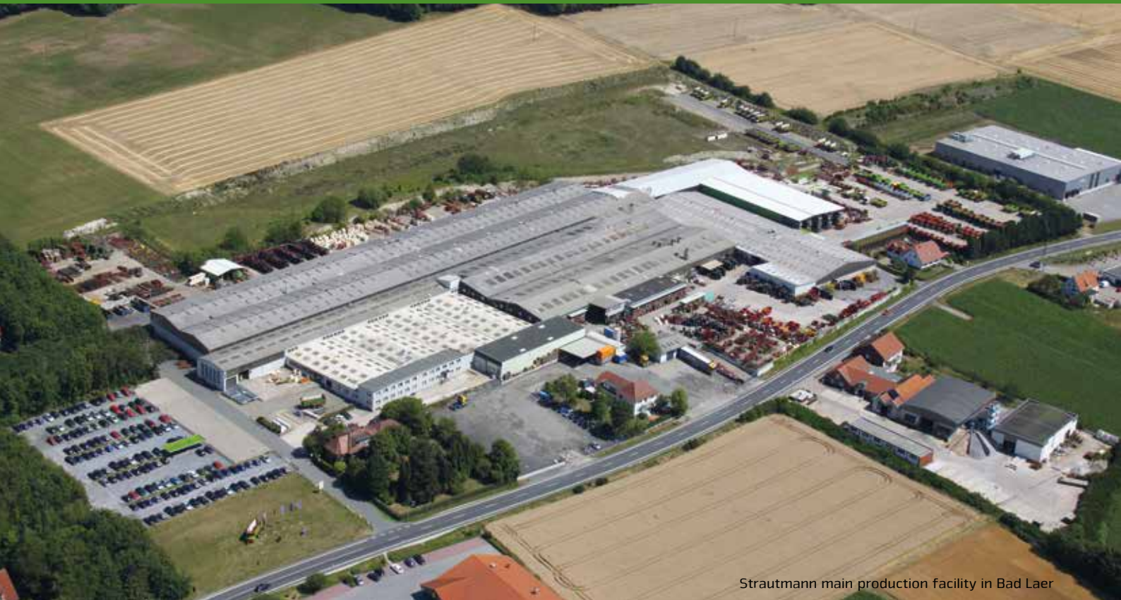
Strautmann main production facility in Bad Laer

B. Strautmann & Söhne GmbH u. Co. KG is a medium-sized family-owned company located in the administrative district of Osnabrück having already celebrated its 80th anniversary of existence and now being managed by the third generation. In a modern plant at the second production site in Lwówek (Poland), Strautmann manufactures individual machine components and, apart from that, also parts