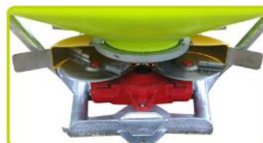
Distribution system of the fertilizer by double plate.